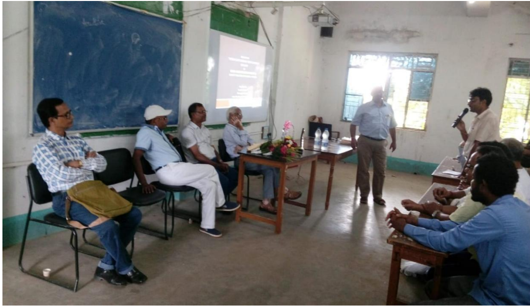
Few moments of the seminar